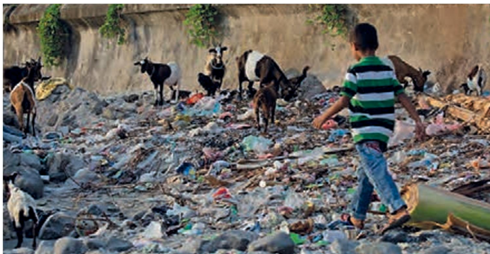
A boy picks his way along a path littered with plastic debris, on the island of Saparua in Indonesia

In the Moluccas in Indonesia, where the river takes care of the rubbish when it rains, flushing the plastic debris into the ocean, EndPlasticSoup is working with its partner Happy Green Islands on Saparua to educate the children. The schoolchildren's task is to fill three big nets of plastic rubbish they collect each day, with a reward once they have completed the task. EndPlasticSoup works with 50 corporate organizations worldwide. All share similar values and all are making a difference in various pockets of the globe, establishing connections with Rotary clubs in the Philippines, Thailand, Egypt, the Caribbean, Honduras, Turkey, Russia and Brazil. One example is the work they are doing with Boyan Slat, the Dutch inventor and entrepreneur, who is also the founder of The Ocean Cleanup, which has developed advanced systems to rid the world's oceans of plastics. The Ocean Cleanup is also targeting rivers.